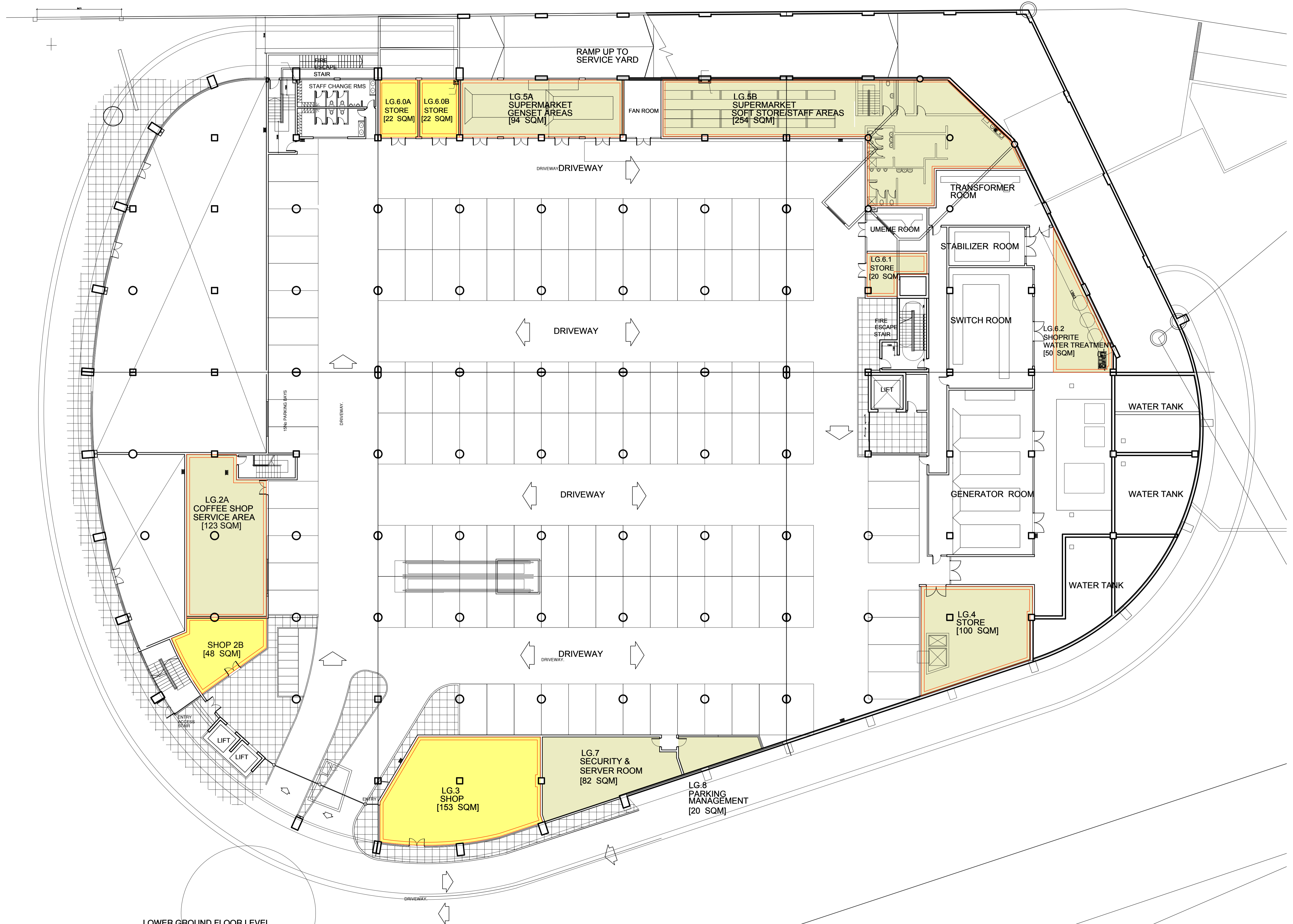
LOWER GROUND FLOOR LEVEL [134 NO. PARKING BAYS]