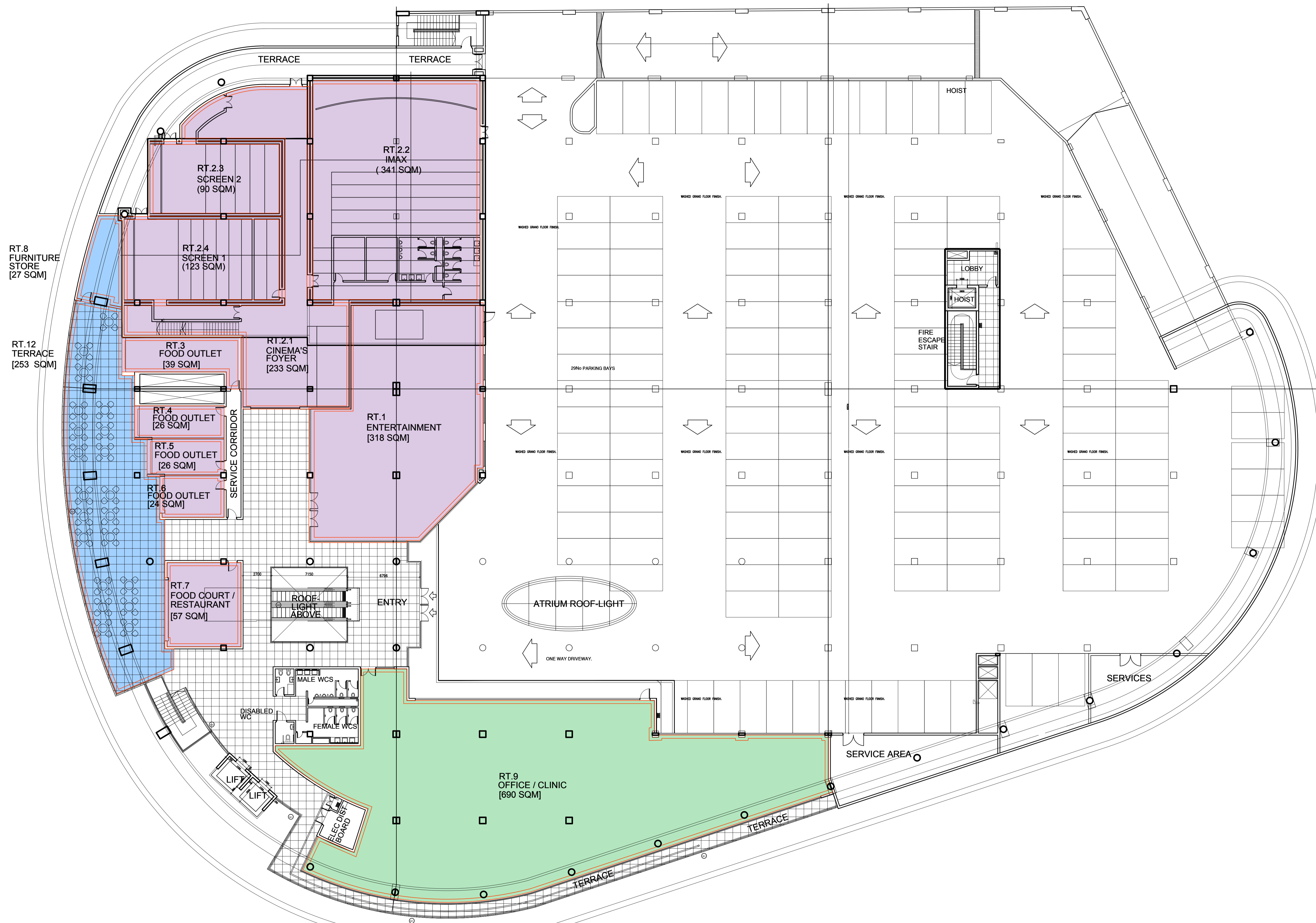
ROOF TOP (1ST FLOOR) - PARKING LEVEL [142 NO. PARKING BAYS]