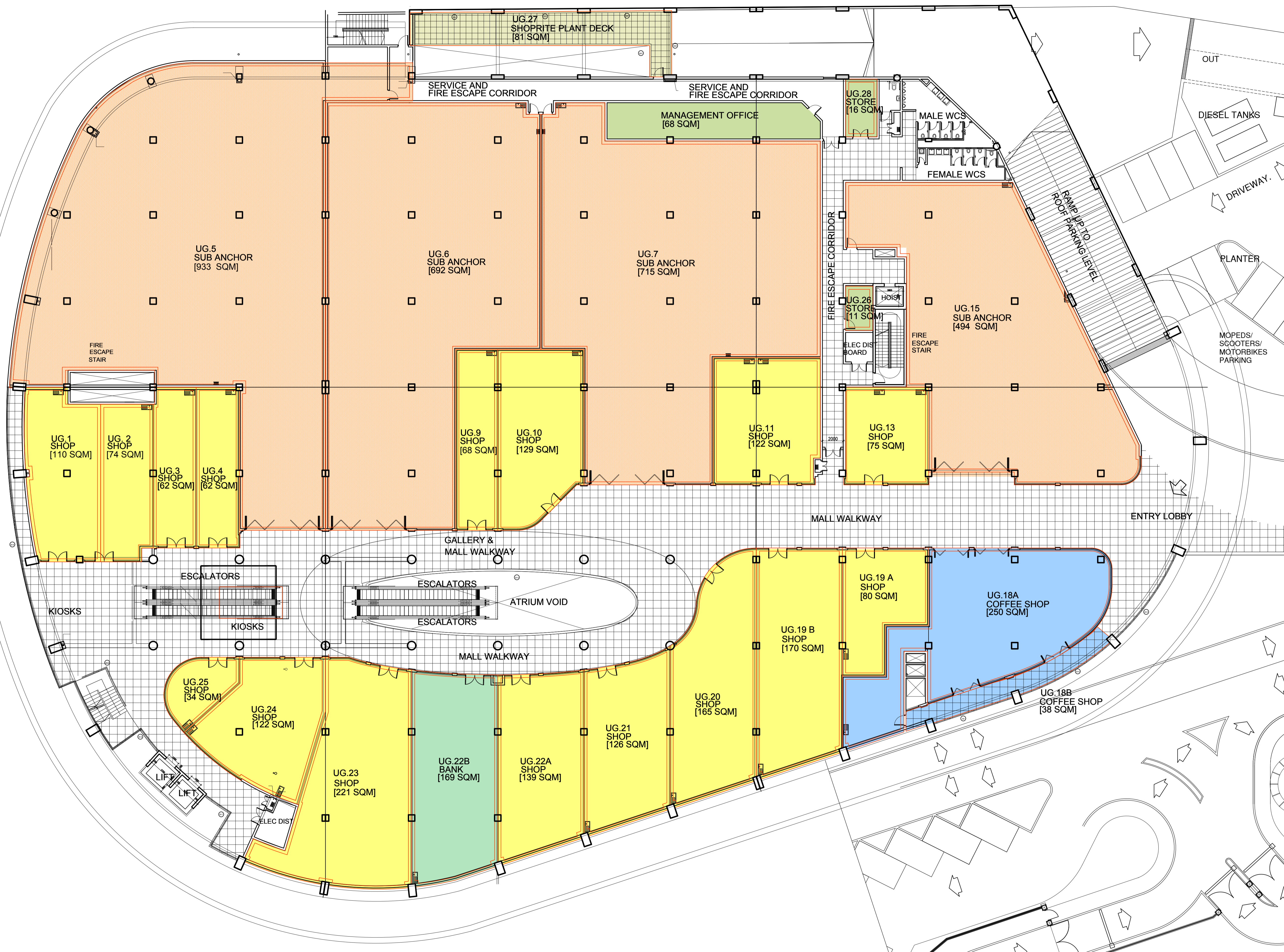
UPPER GROUND FLOOR LEVEL